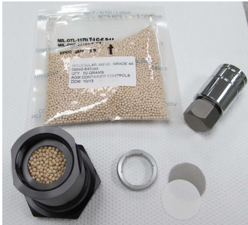
Figure 3 50 Gram Refill and Refill Tool